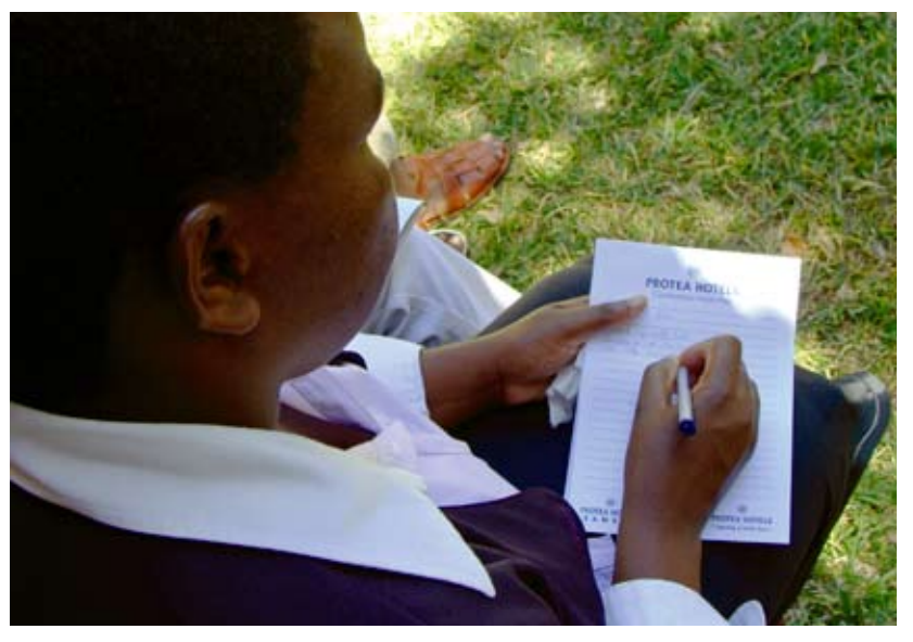
A reporter takes notes in a training session for journalists.