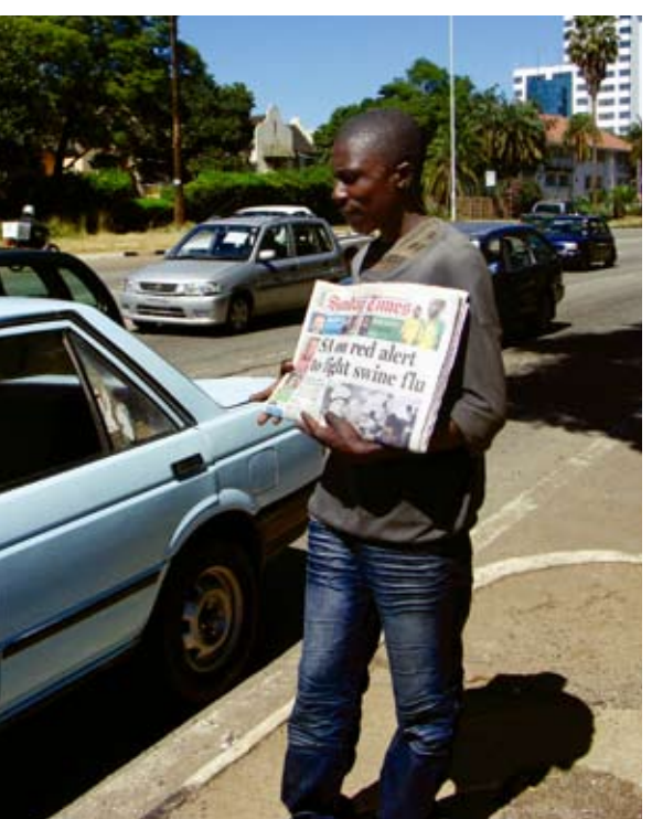
Newspapers are sold on street corners in Harare.