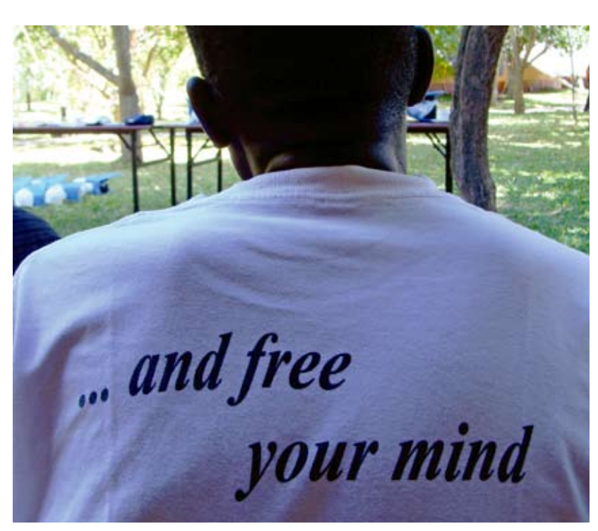
A journalist wearing a t-shirt advocating free media and a free mind.